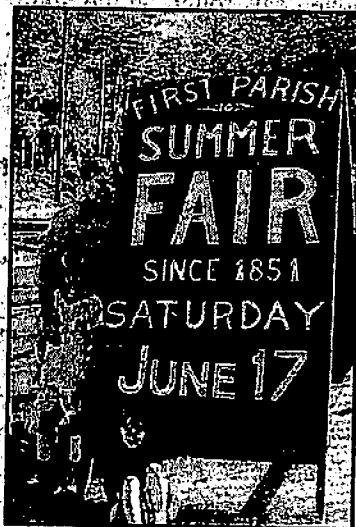
The First Parish summer fair kicks off on June 17.